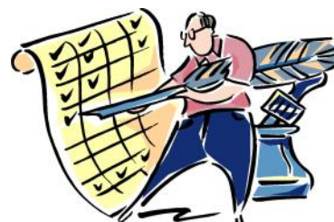
Attendance and Offering Report