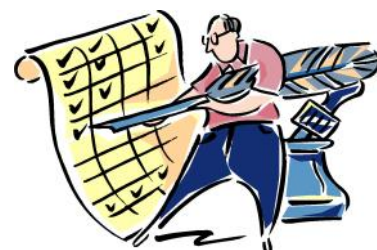
Attendance and Offering Report

February 22.....15 February 15.....14 February 08.....13 February 01.....15