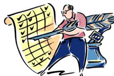
Attendance and Offering Report