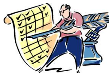
Attendance and Offering Report